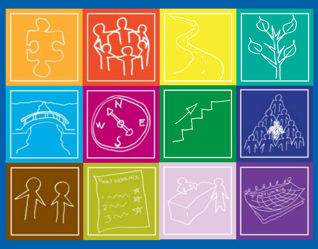
Training Packet Produced By School & Main Institute